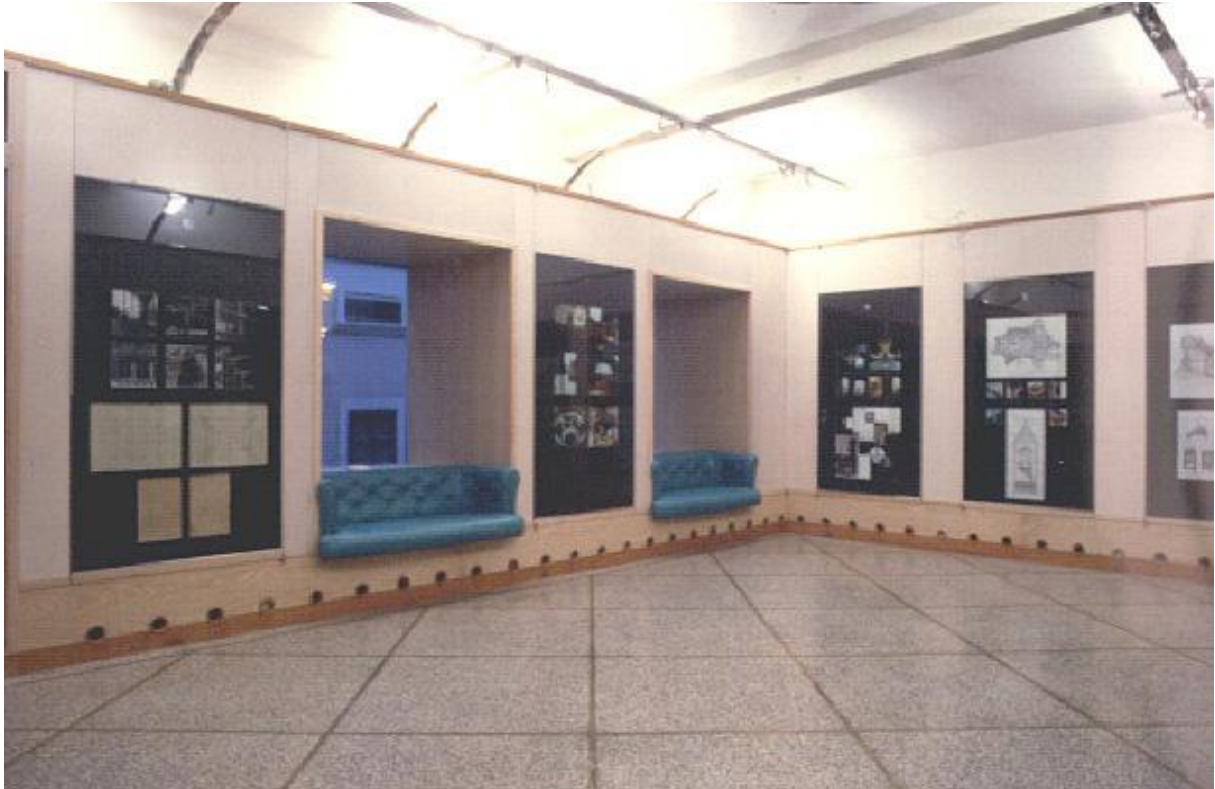
View to the gallery space